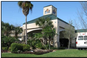
Holiday Inn Altamonte Springs

The Convention Committee has finalized the details for the 45th Annual Florida State Convention. This year, the Convention is going to be at the Holiday Inn at 230 West State Road 436 Altamonte Springs, which is located at Interstate 4 and West State Highway 436 at