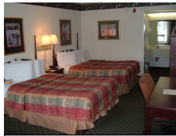
Room with inside entry

The Jewelry, Craft, & Hospitality Room will be located in the Crown Room of the Hotel. We will be allowed full access to this room when