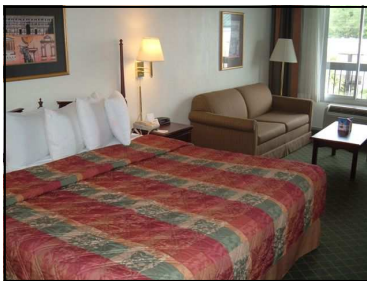
Room with outside entry

The deadline for hotel room reservations and Convention registration is November 14, 2007. Please